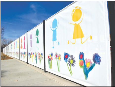
View all 3 images.

PALMDALE - Desert Rose Elementary School's new kindergarten playground is a colorful wonderland with places for boys and girls to climb over and under things and slide to a landing on the soft, spongy play surface.